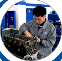
Sime Darby Industrial Power Sdn. Bhd Malaysia